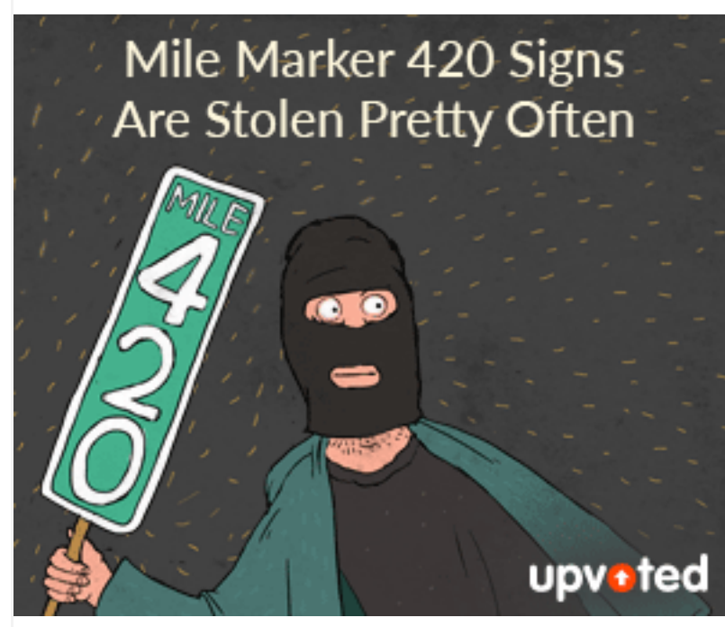
discuss this ad on reddit